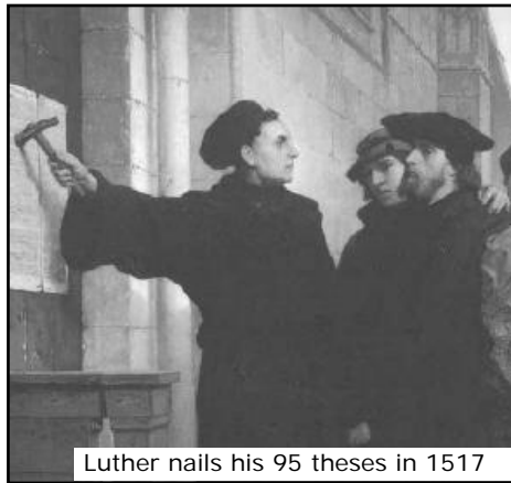
Luther nails his 95 theses in 1517

Almost 500 years ago an obscure monk challenged the Roman Catholic Church’s practice of selling indulgences. For a few coins the purchase of an indulgence granted the recipient the instant forgiveness of sins with the promise of time off from the refining fires of “purgatory.” The money raised in the sale of salvation was used to pay off the debts of the German archbishop and to help build the colossal St. Peter’s Cathedral in Rome.